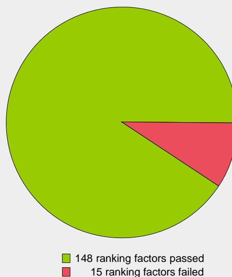
Ranking Factors Performance